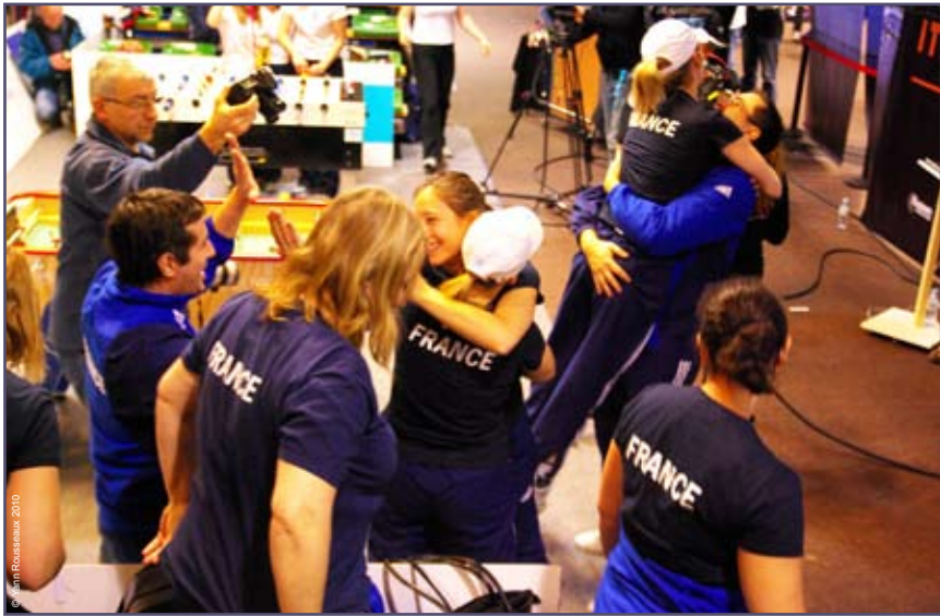
Table soccer in photos