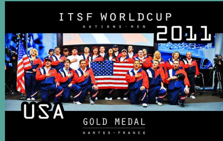
The USA team - world champion titleholder