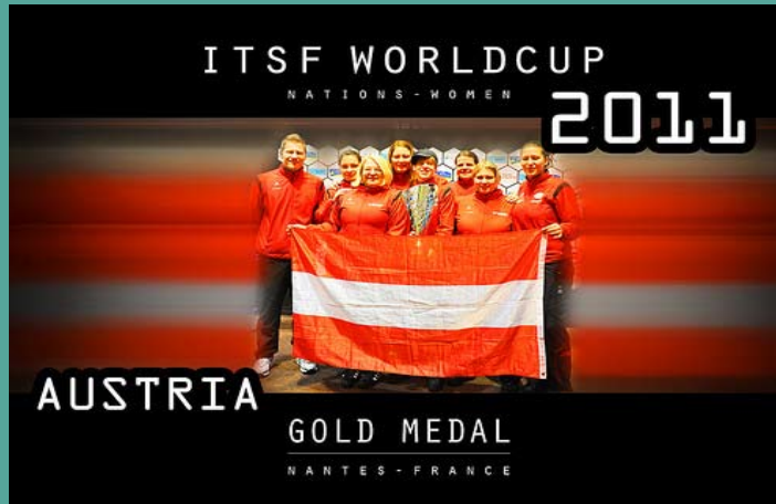
The Austria team - world champion titleholder