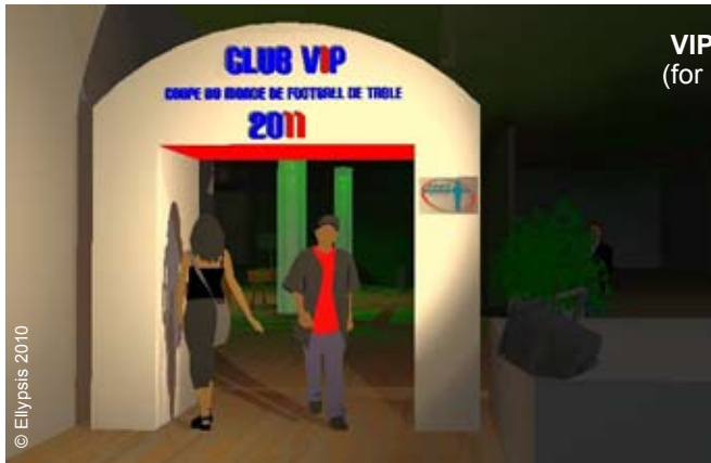
VIP ENTRANCE (for information only)